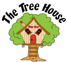
Before and After School Club